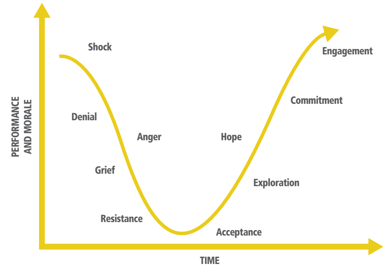
Figure 2: The change curve

Source: Adapted for use with organisational change from Kübler-Ross (1969)