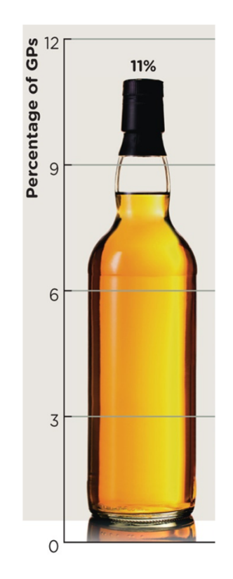
Figure 5: Percentage of GPs turning to alcohol as a result of work pressures

Source: PULSE Today (November 2017), 'Revealed: one in seven GPs turns to alcohol and drugs to cope